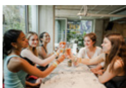
Breakfast Area & Bar