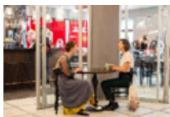
Breakfast area & Bar